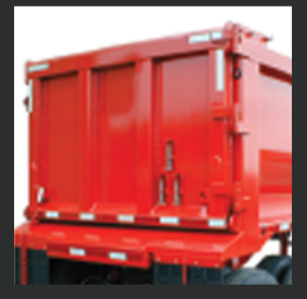
Barn door tailgate with hinges on top and on side