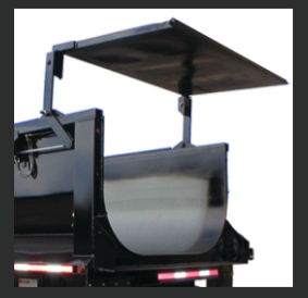
Dual Hi-Lift & standard gate operation